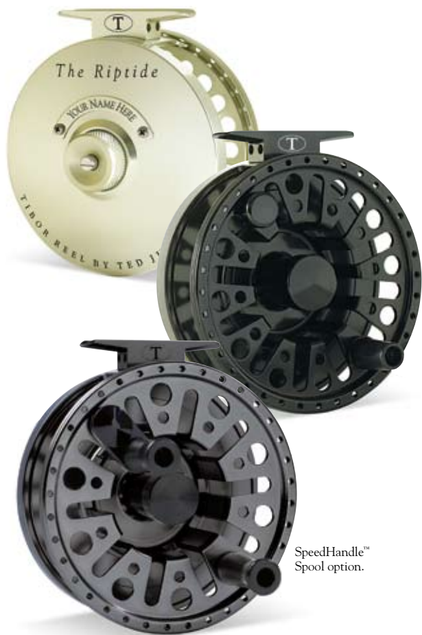
SpeedHandle™ Spool option.

The Tibor Reels are available in these fine finishes. Please see your dealer or tiborreel.com for details.